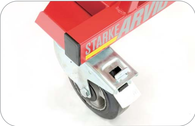
2 off. braked castors