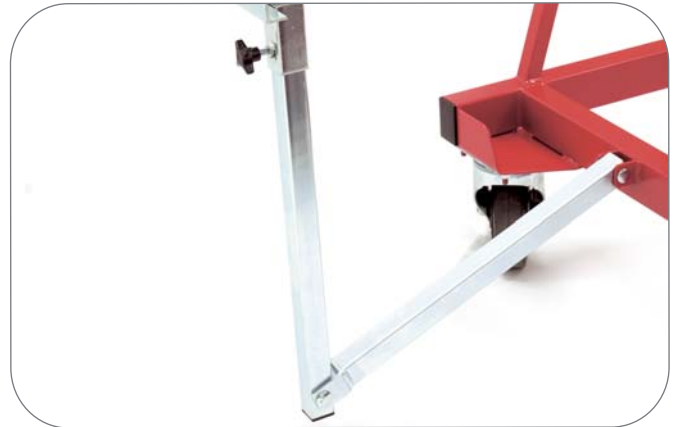
Supporting legs in lowered position