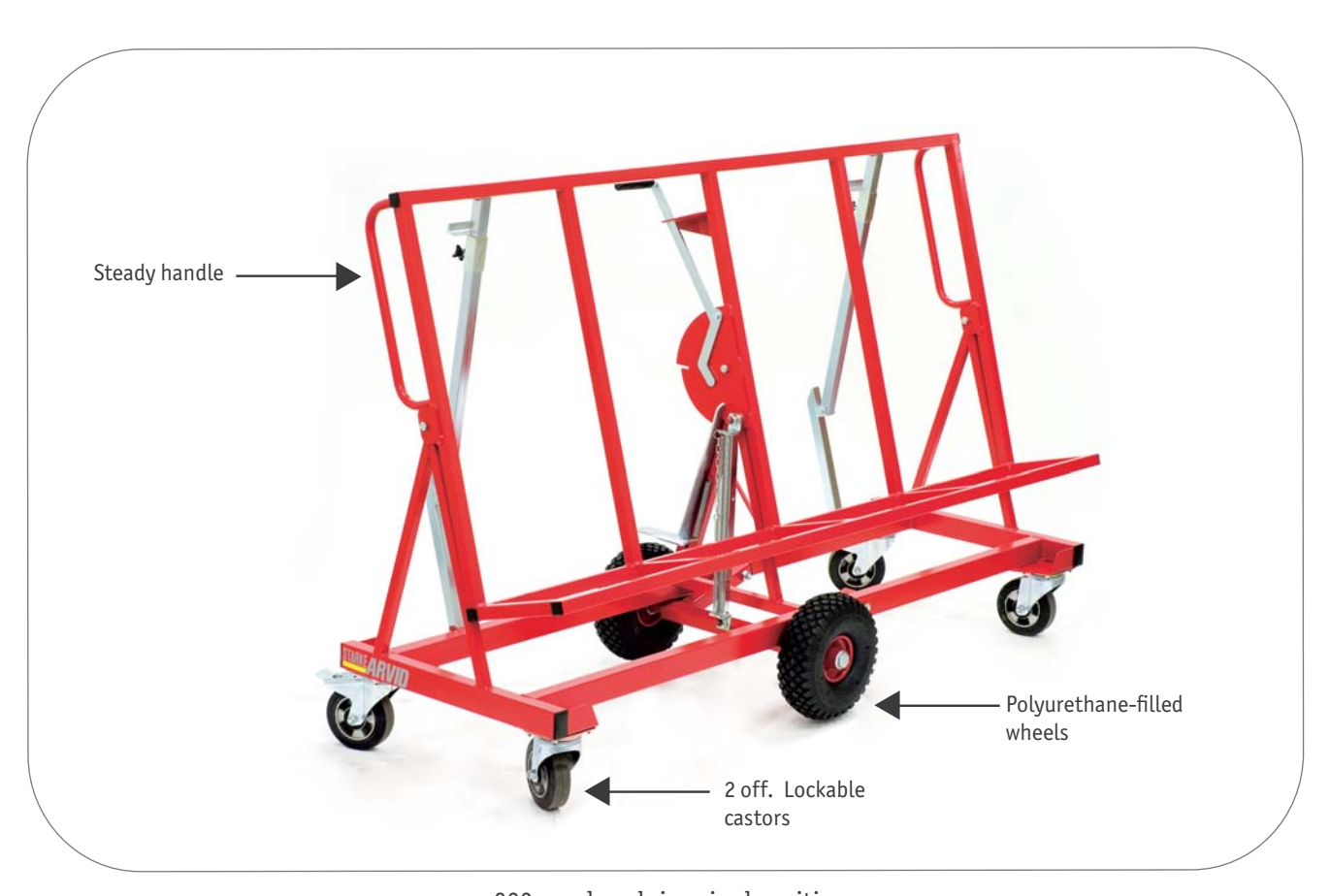
900 mm bench in raised position