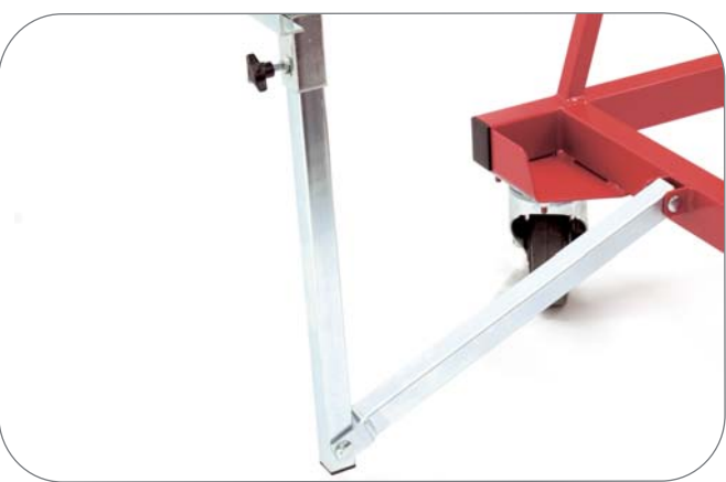
Supporting legs in lowered position