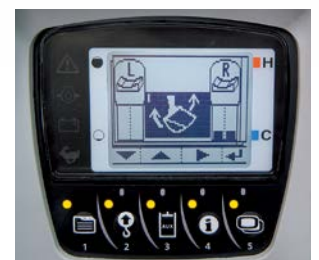
Max. Oil Flow Setting