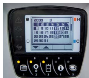
Operation History Record